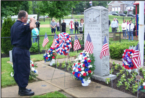
Before and after the parade, wreath-laying services were held in the Upland Baptist Church cemetery and at the war memorial at the corner of Church & Sixth Streets.