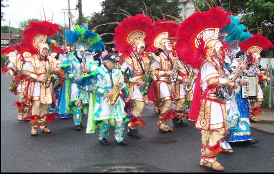
Residents lined the streets to watch Upland Borough's Annual Memorial Day Parade on May 29. The procession featured four marching string bands, two fife and drum corps, fire trucks from a dozen Delco companies, and hundreds of participants on foot.