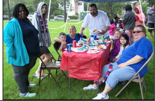
Despite some light rain, the 14 th Annual Memorial Day Picnic was once again a big hit with Upland residents. The free event is sponsored by the congregations of Upland Baptist Church and Resurrection Life Church.