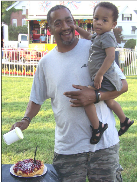
The wide variety of tasty food that was available at the carnival kept hungry attendees happy.