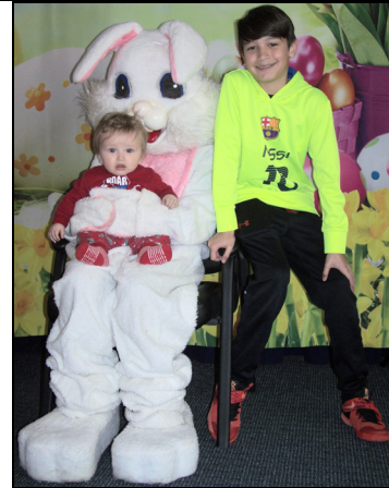
The Easter Bunny also stopped by MacQueen Hall to sit for photographs with the kids, while the breakfast served up by the Community Affairs Committee was enjoyed by all.