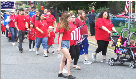
The Annual Memorial Day Parade gave several marching bands and local groups a chance to strut their stuff.