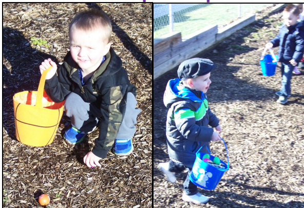
Easter Weekend festivities started off on March 31 with the Annual Easter Egg Hunt, with children up to age 4 racing to collect the goods in the Upland Park playground, where the Easter Bunny made his first appearance of the day.