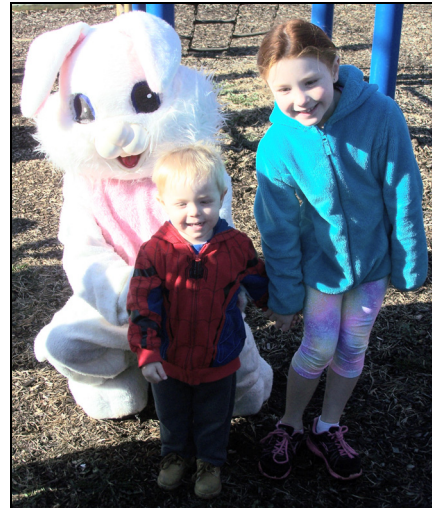
The Annual Easter Egg Hunt is co-sponsored by Borough Council, Upland Fire Co., and the Upland Athletic Club.