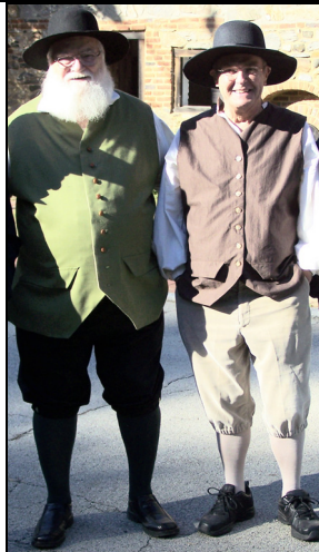
The next day, residents collected Passport stamps from nine different sites around the borough, including the 1683 Caleb Pusey House on Race Street, where the first chapter of Upland and Pennsylvania history was written.