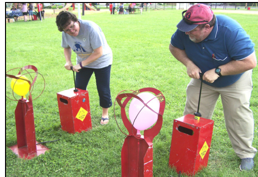
Sunday, May 25 started off with a joint worship service for Upland Baptist and Resurrection Life Churches, followed by an afternoon of free carnival games (for kids of all ages) and a Corn Hole Tournament at Bristol Lord Field.