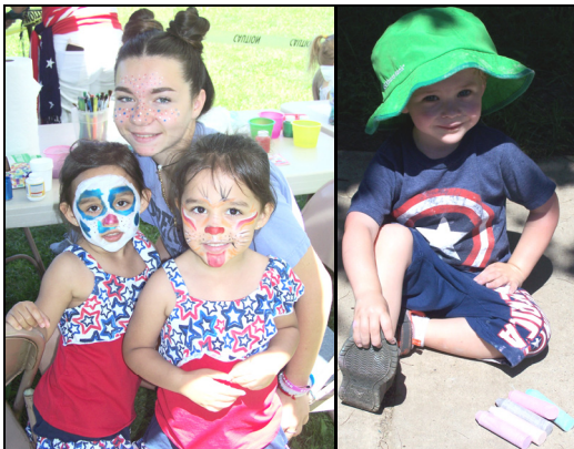
The church-sponsored 16 th Annual Memorial Day Family Picnic drew a large crowd by offering free burgers and hot dogs off the grill, as well as tons of fun for the children – none of which required the use of an electronic device.