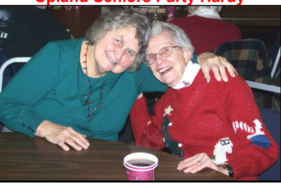
The Upland Senior Citizens Club held its Annual Christmas Party at MacQueen Hall on Dec. 11, getting a head start on the season of good cheer.