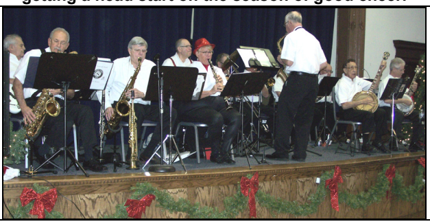
This year, for the first time, the USCC party featured a performance by a live band, as the Legends Band of Delaware County from Senior Community Services delighted the audience with a catalog of classic tunes.

UBC Night of Music Lifts Up Holiday Spirit