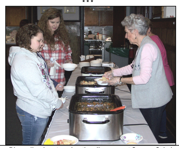
Diners lined up to enjoy the all-u-can-eat Soup-n-Salad Fundraiser held in MacQueen Hall on Feb. 17.