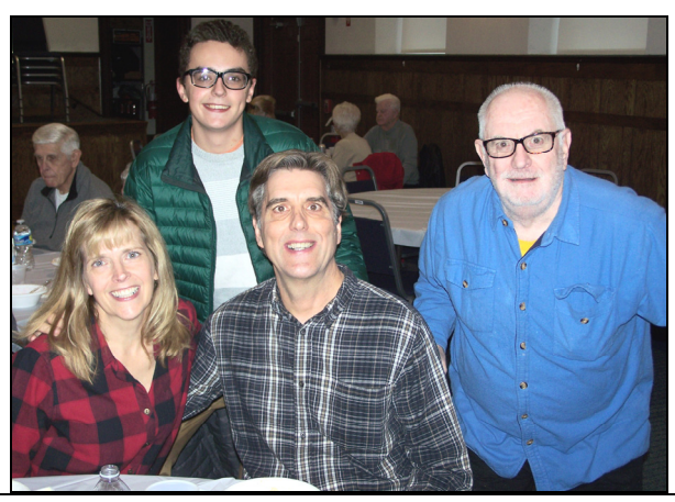
As is always the case, it was Upland families and friends who turned out to commune and dine together that made this year's Soup-n-Salad Fundraiser a big success.