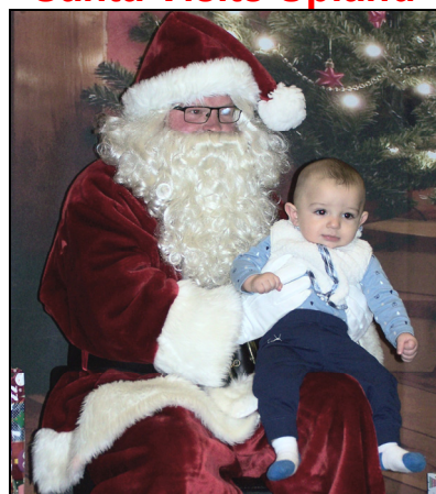
Kids of all ages gave Santa Claus a warm welcome and lots of hugs at MacQueen Hall during the Annual Youth Christmas Party on Nov. 24.