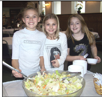
And while the salad bar was popular, it was the homemade soups and chili that kept them coming back for more.