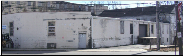
This long-vacant Orb Industries building, located on the south side of Race Street, has been targeted for rehabilitation and a new life as Race Street Range.