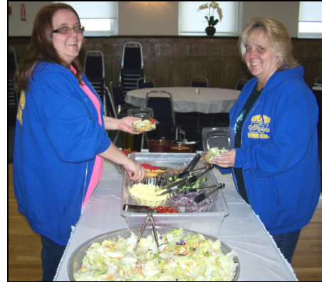
The Annual All-U-Can-Eat Soup & Salad Dinner Fundraiser was held at MacQueen Hall on Feb. 18.