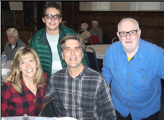
As is always the case, it was Upland families and friends who turned out to commune and dine together that made this year's Soup-n-Salad Fundraiser a big success.