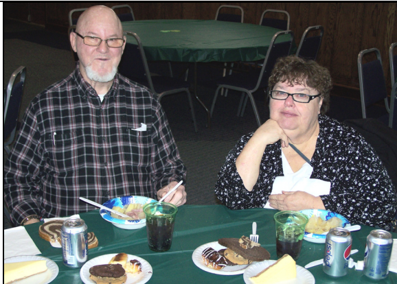
There was no shortage of desserts available to go along with the main course of ham, cabbage and potatoes.