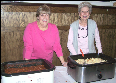
(Above) The Community Affairs Committee was assisted by the volunteers who served up the homemade chili and soups that are a staple at the Soup-n-Salad Dinner.