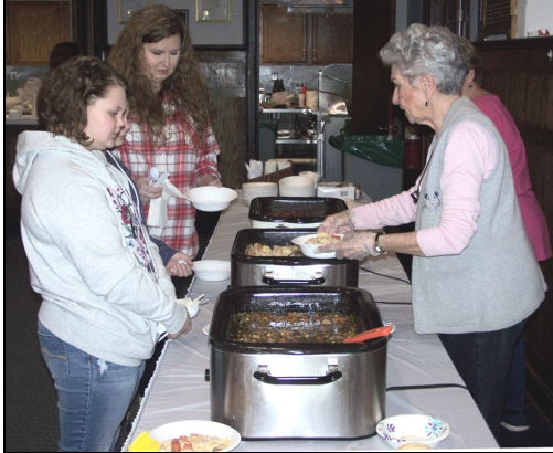
Diners lined up to enjoy the all-u-can-eat Soup-n-Salad Fundraiser held in MacQueen Hall on Feb. 17.