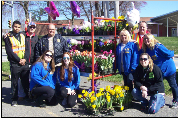
Upland Fire Company No. 1 held another successful flower sale fundraiser on Easter weekend. The volunteer members of Upland's lone fire company are grateful for the support they receive from the community they protect.