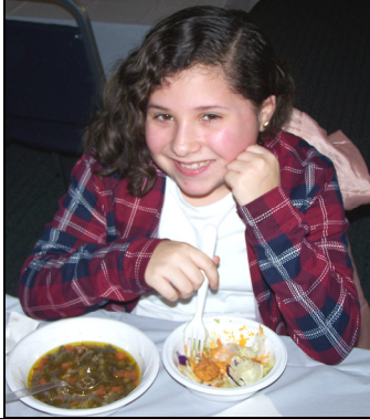
A pair of successful Community Affairs Committee fundraisers were held at MacQueen Hall in February, starting with the Annual Soup-n-Salad Dinner on Feb. 16.