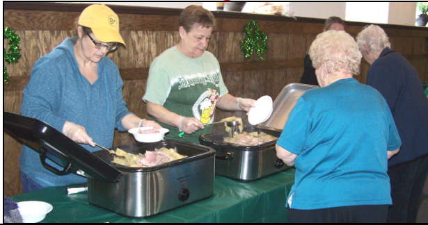
On March 11, senior citizens were treated to a traditional meal of ham & cabbage to celebrate St. Patty's Day, courtesy of the Community Affairs Committee.