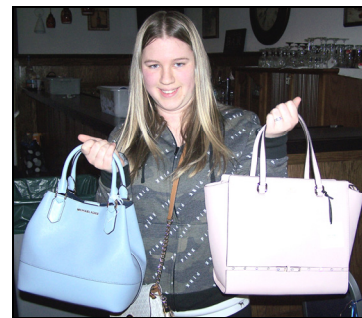
...And the lucky winners were happy to show off their prizes.