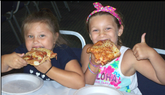
...But the highlight of the event may have been the free pizza and the make-your-own ice cream sundaes.