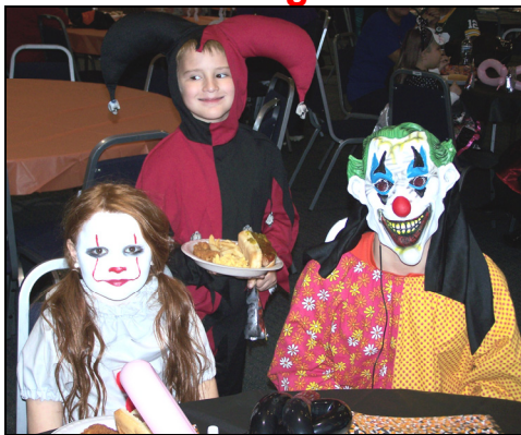
Ghoulish clowns were among the popular costumes at this year's Youth Halloween Party on Oct. 28.