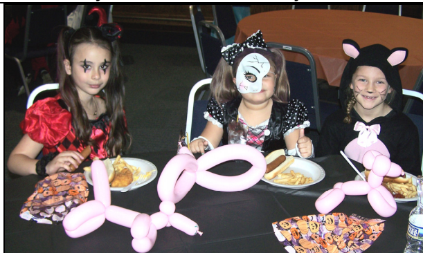
While other costumes spanned the spectrum from clever and cute to downright adorable.