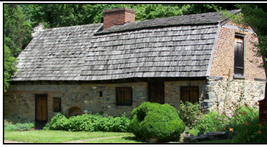
The Caleb Pusey House