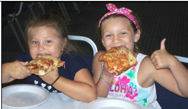
...But the highlight of the event may have been the free pizza and the make-your-own ice cream sundaes.