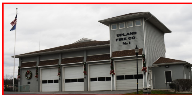
Upland Fire Co. #1

The Upland Fire Co. #1 was organized on January 26, 1926. Throughout the past (almost) 95 years, the UFC has serviced our community as well as surrounding areas. Taking pride in the fact the UFC is entirely on a volunteer bases, the organization is always looking for others who would like to come on board to assist our community. We encourage those interested to contact the UFC- your involvement would be greatly appreciated.