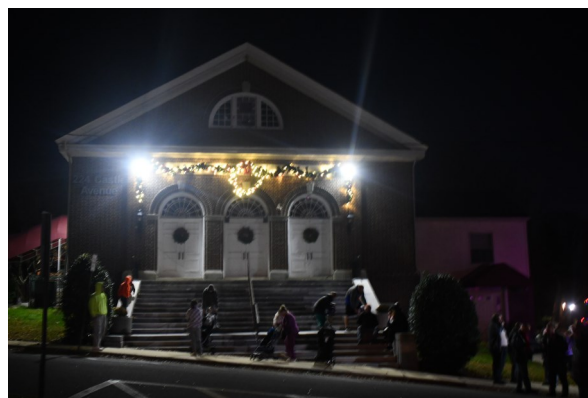
Photos (Top) MacQueen Hall, (Bottom L-R) Santa with lighted borough tree, Councilman Steigerwalt manning the hot chocolate