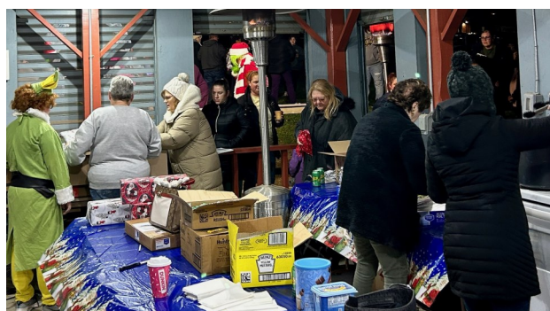
Another successful UBCAA event! Photos (L-R) Council members & volunteers on gifts and refreshment duties. Santa & the Grinch