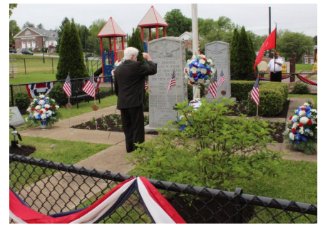
War Memorial