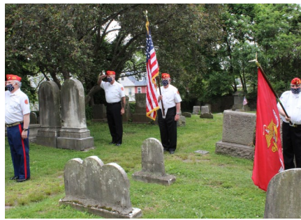
Grave of Civil War Captain Blakely