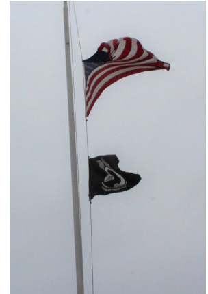
Flags at half-staff