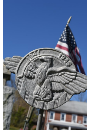
WWII Memorial Marker

The borough showed the ceremonies on their Facebook page (Upland Borough DELCO PA) live. All photos are available on the borough's social media accounts.