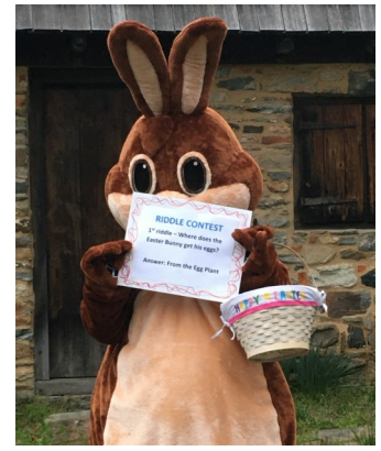
The Easter Bunny visited various locations within the borough for a fun-filled riddle contest.