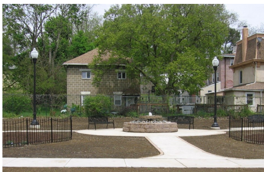
Park located on 8th & Hill Streets

The newly installed park at 8th & Hill Streets has finally been completed minus some minor landscaping details. The new installed wrought iron fence replaced the wood farm style fencing and the fountain is now functioning.