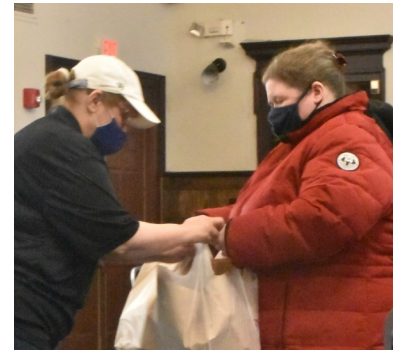
Members of the Community Affairs Assoc. & Borough residents picking up their orders