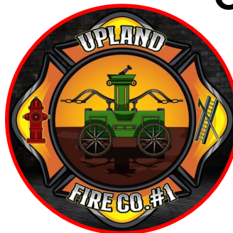
Upland Fire Co. #1

If interested, please contact (610) 874-4885.