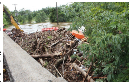
Debris under Kerlin Street Bridge

Residents are reminded that when torrential downpours happen humans are not the only ones to suffer but wildlife in our wooded areas are affected and displacement is a given when flooding occurs.