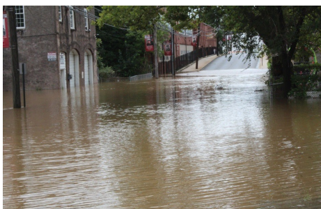
Flooding on Upland Avenue

Heavy equipment was employed in order to clean out the logs and debris which came from upstream, becoming lodged at the bridge.