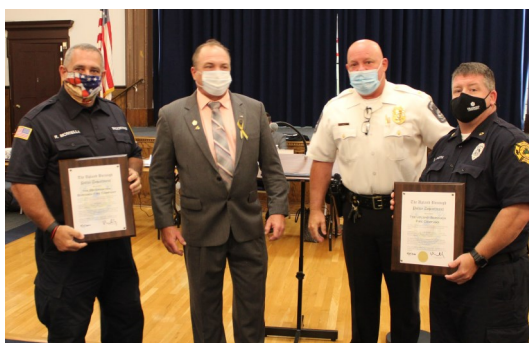
Awards issued to Brookhaven Fire Co. & Upland Fire Co.